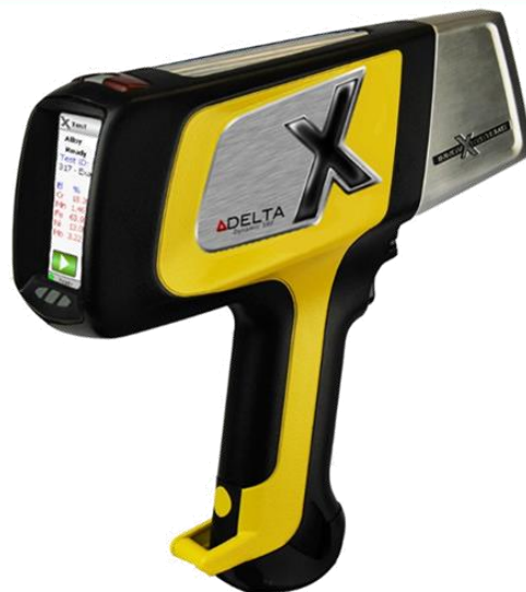
X-Ray spectrometer (DELTA Olympus)