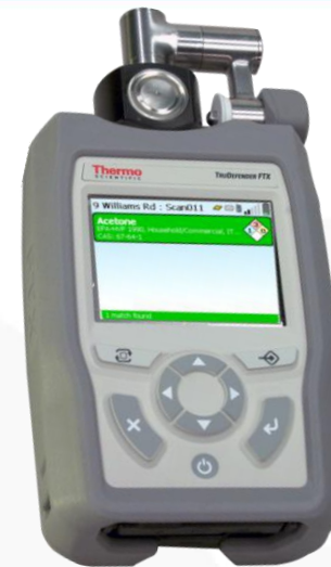
Infrared spectrometer (TruDefender)