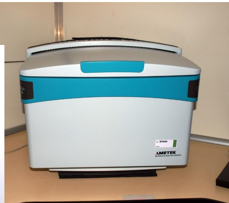
X-ray fluorescence spectrometer