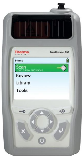
Raman spectrometer (FirstDefender)